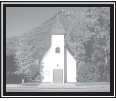
Chapel of the Holy Cross Original Minturn Church