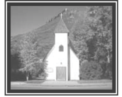
Chapel of the Holy Cross Original Minturn Church

Serving the community since 1913 and a parish since 1952