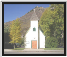
Chapel of the Holy Cross Original Minturn Church