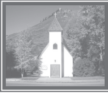
Chapel of the Holy Cross