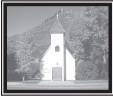
Chapel of the Holy Cross Original Minturn Church