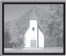
Chapel of the Holy Cross Original Minturn Church