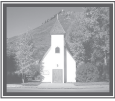
Chapel of the Holy Cross Original Minturn Church