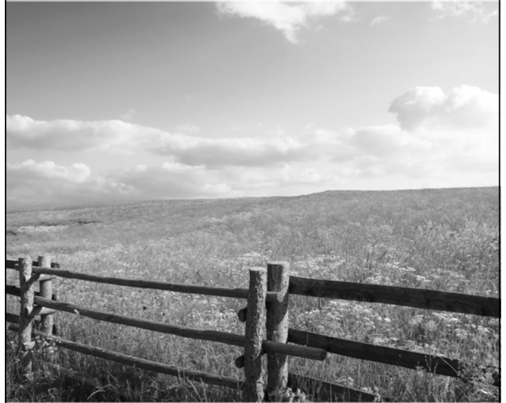
Excerpts from the Lectionary for Mass ©2001, 1998, 1970 CCC. Cover design ©Liturgical Publications Inc.