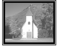
St. Patrick Chapel