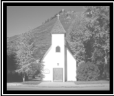
St. Patrick Chapel

St. Patrick Catholic Parish Office: 476 Pine Street Minturn, CO 81645 Mailing Address: P.O. 219 Minturn, CO 81645-0219 Phone: (970) 827-9559 (970) 476-3347 (Fax) E-mail: st_patricks@comcast.net Website: http://stpatricksminturn.com Serving the community since 1913 and a parish since 1952